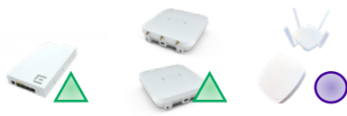
AP302W AP305C/CX AP3000/X